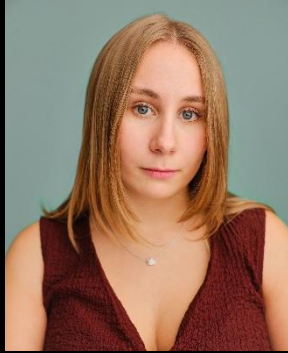
Ronald 'Buster' Edwards Bustie