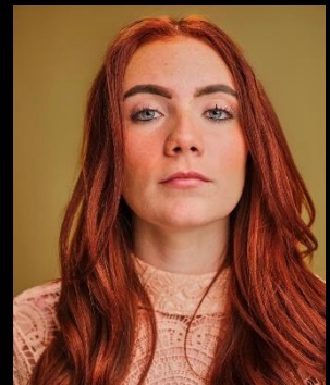
Maid Detective Scurry