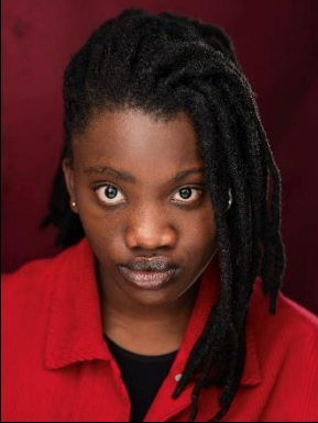
Reporter | Waiter