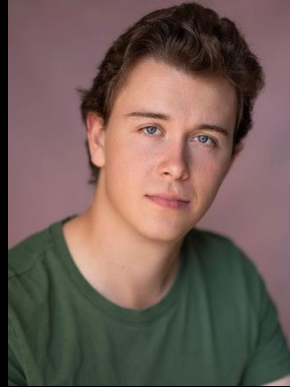
Doctor | Man | Clerk