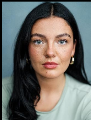
Barber 1 Telephone Girl