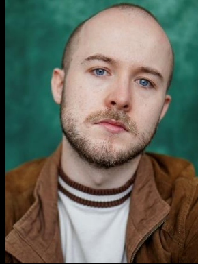
Man at Bar | Judge Filing Clerk