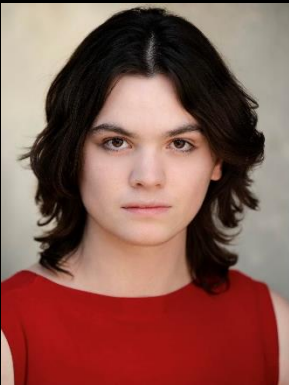
Woman at Bar Priest