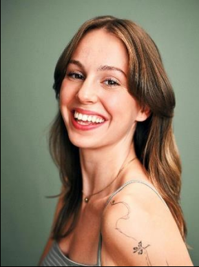
Girl | Reporter