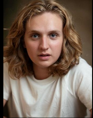
Bailiff | Man