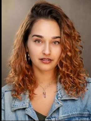
Matron | Adding Clerk Court Reporter