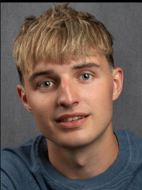
Boy at Bar | Guard Defence Lawyer