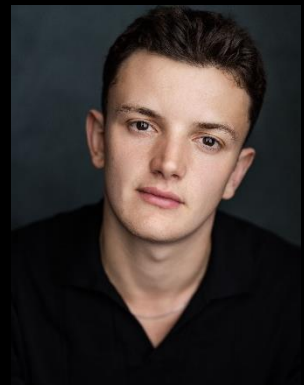
Guard | Second Man