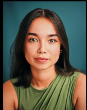
Nurse | Jailer